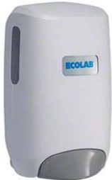
Manual Dispenser Item #630-92023021

Foam Sanitizer 1200 ml Cartridge $19.99 Item# 630-600093 Soap 1250 ml Cartridge $19.99 Item# 630-6000114