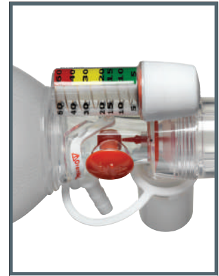
Ambu Disposable Pressure Manometer connected to Ambu SPUR II Resuscitator