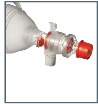
Disposable PEEP Valve 20