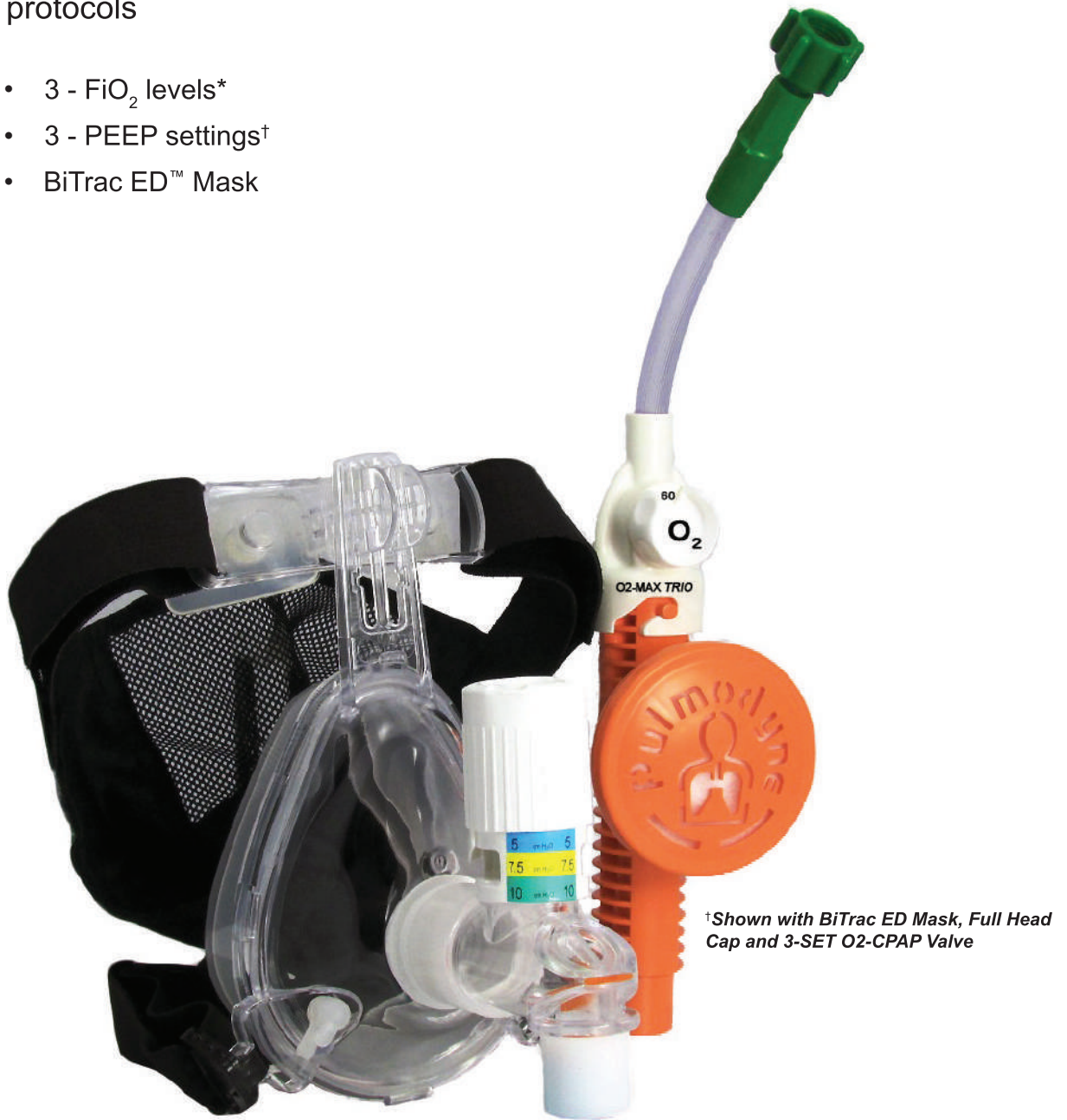
†Shown with BiTrac ED Mask, Full Head Cap and 3-SET O2-CPAP Valve

*Fractional inspired oxygen (FiO 2 ) levels of approximately 30%, 60%, 90%+