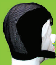
Full Cap Head Gear