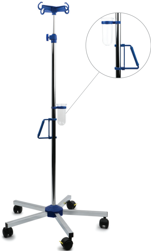
Regular I.V. Pole