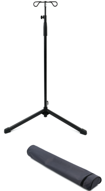
Folding I.V. Pole With Bag