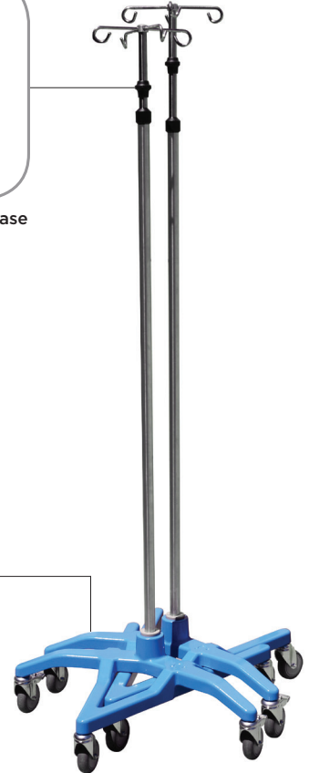
Sturdy Base for Added Stability & Durability