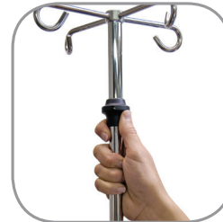
Adjust Pole Quickly w/ Ease