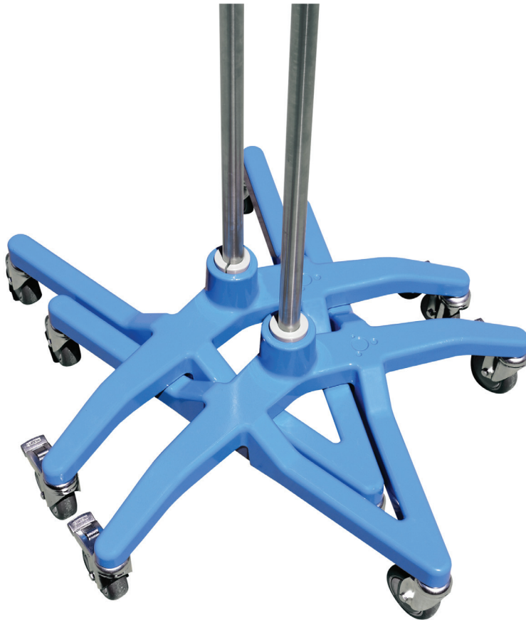
24" Wide Base Design Leaves Wider Footprint for Added Applications

"Designed for ultimate efficiency & durability"