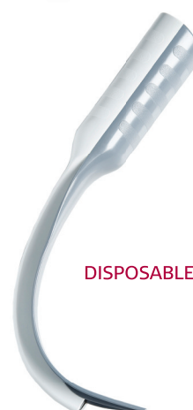
DISPOSABLE STANDARD BLADE