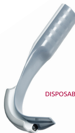
DISPOSABLE CHanneled BLADE