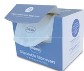
Boppy® Disposable Slipcover 48/Case